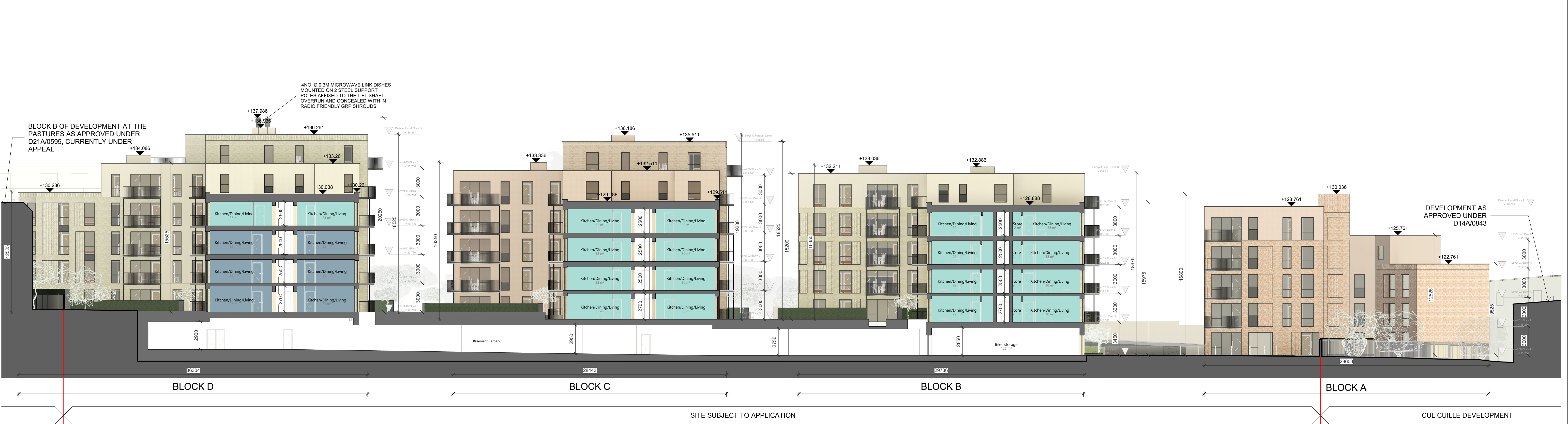
Section C-C 1 : 200