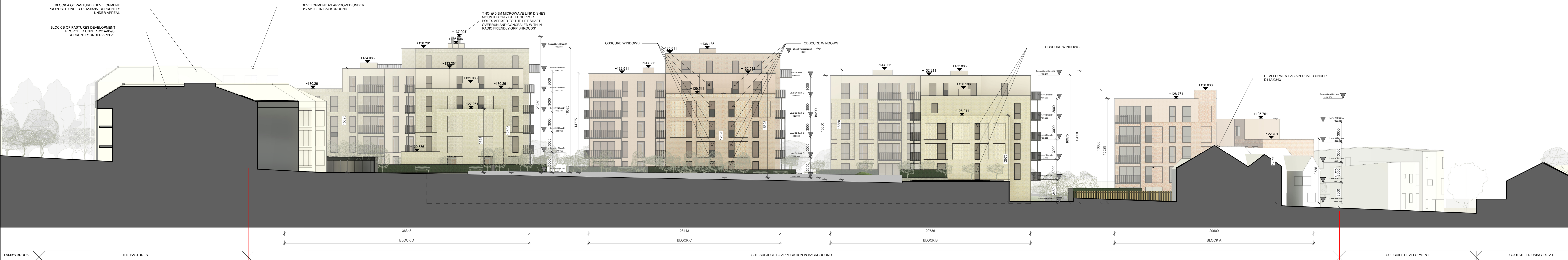
Proposed East Elevation 1 : 200