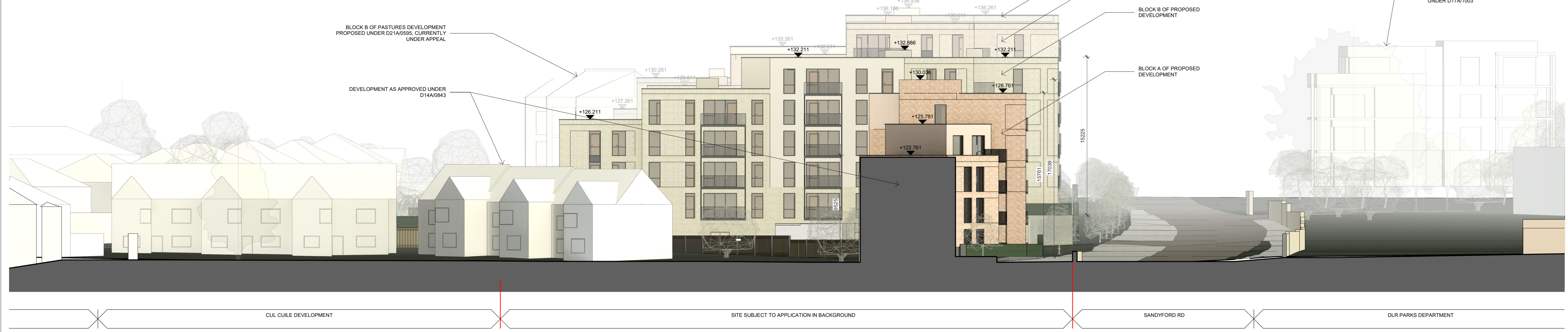
Proposed North Elevation 1 : 200