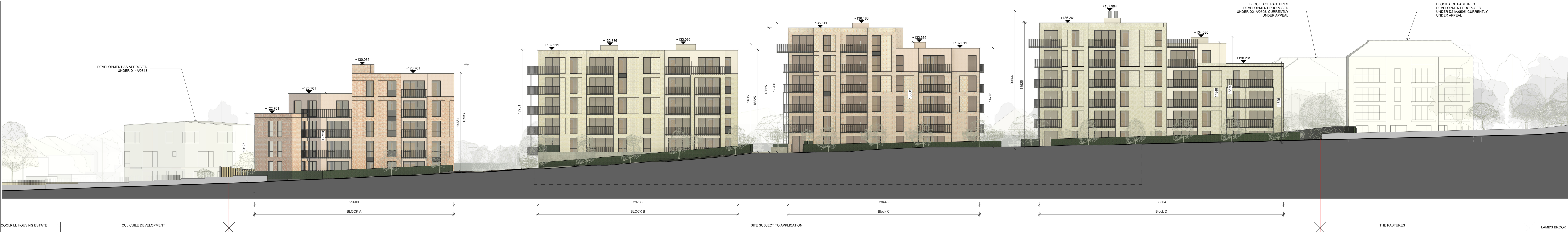
Proposed West Elevation 1 : 200