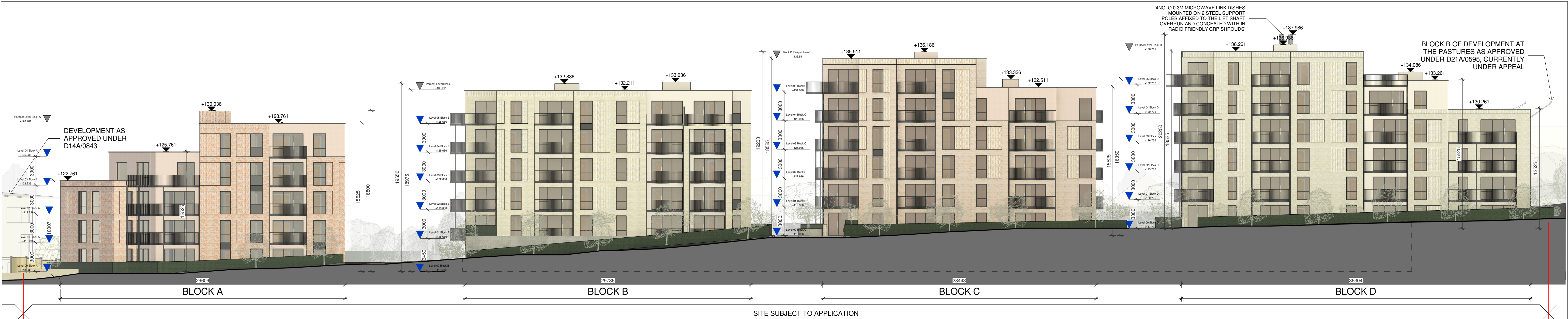
Proposed West Elevation 1 : 200