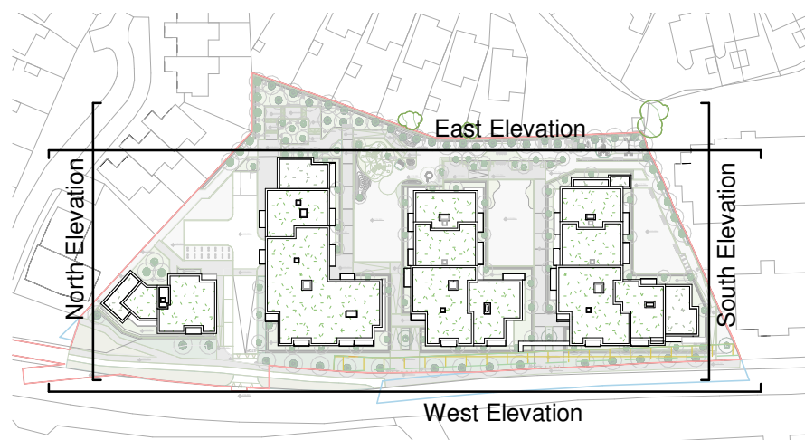
Plan Legend | 1 : 1750