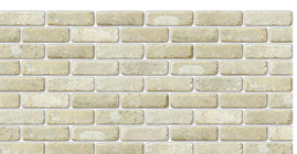
light cream brick