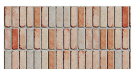
light red brick