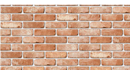
light red brick