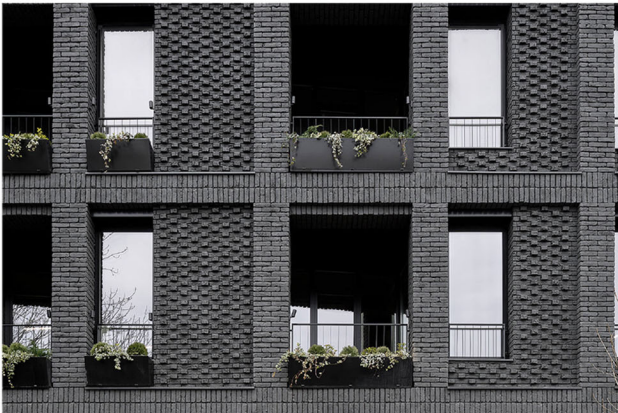
Mia Dorcol // Zabriske Studio [Belgrade, Serbia] Variety and depth are introduced in the facades with recessed reveals, various brickwork patterns and subtle changes in the materials.