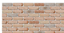
light red brick