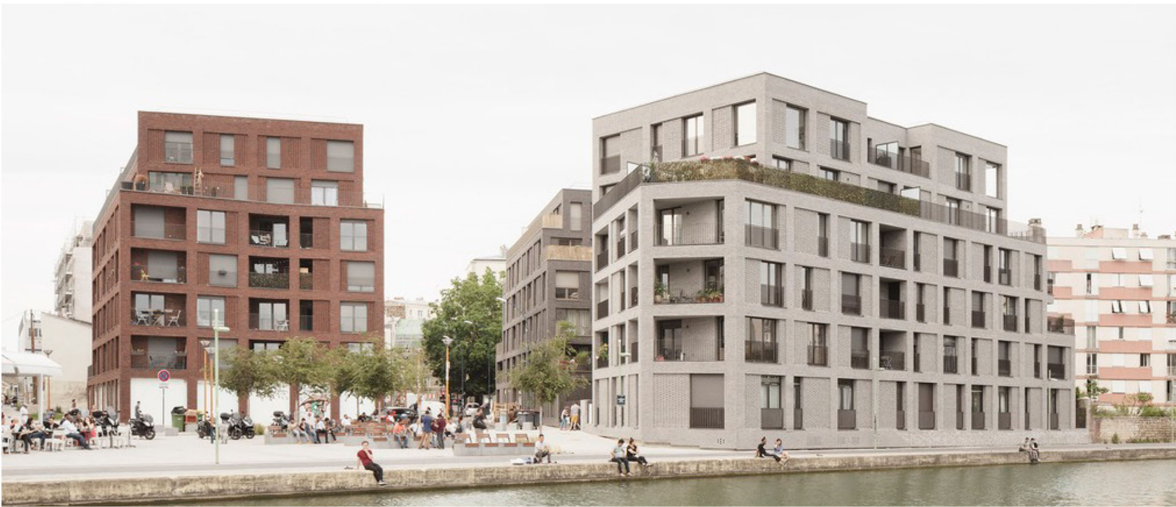
Avenier Cornejo 88 Housing Units // Avenier Cornejo Architectes [Paris, France] Each building has a distinct shade of brick - anthracite grey, light grey and red - as well as metal detailing of windows, shutters and balustrades in different metallic shades contributing to an impression of diversity and homogeneity at the same time.