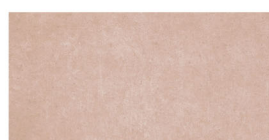
light red render