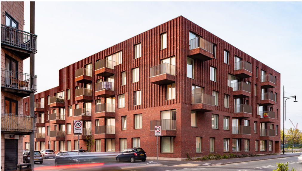
Hulme Living Leaf Street Housing // Mecanoo Architects [Hulme, UK] Fluted brick detailing visually reduces the scale of the building and creates a dynamic rhythm in the facade as the building volume meanders across the plot and gradually decreases in scale to the north.