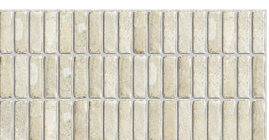
light cream brick