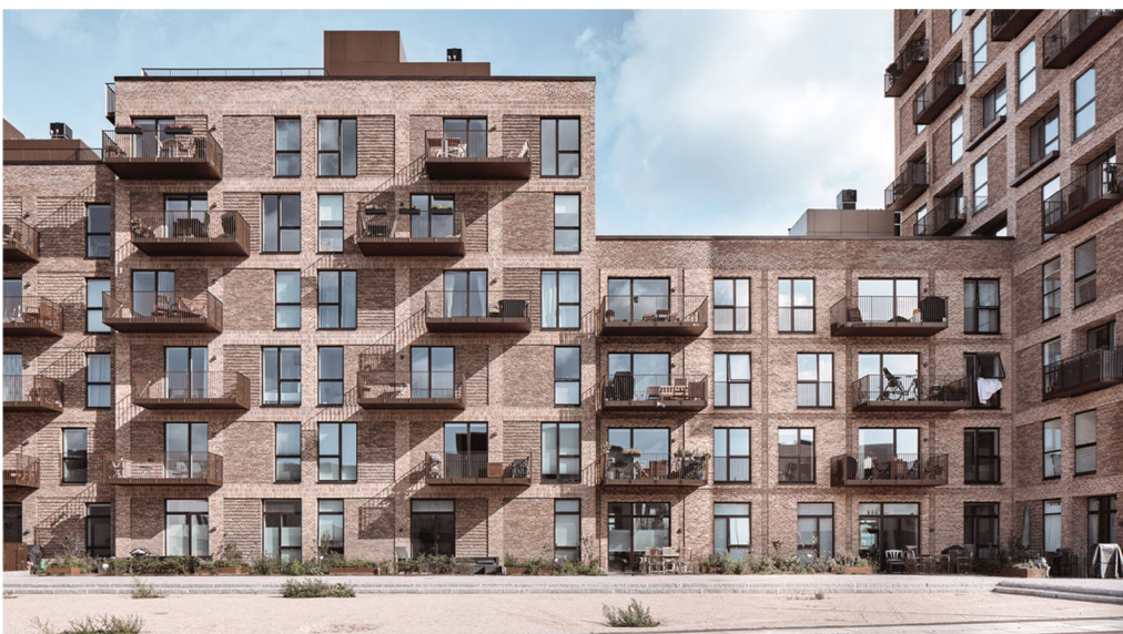
Amaryllis House // Tegnestuen LOKAL + Mangor & Nagel [Copenhagen, Denmark] A palette of red and brown bricks with recessed panels give the building a clear, legible and expressive relief from a distance that reduces the scale of the building. The same brick is used on all sections of the building, but detailing, mortar-type and color vary creating a clear distinction between the facades.