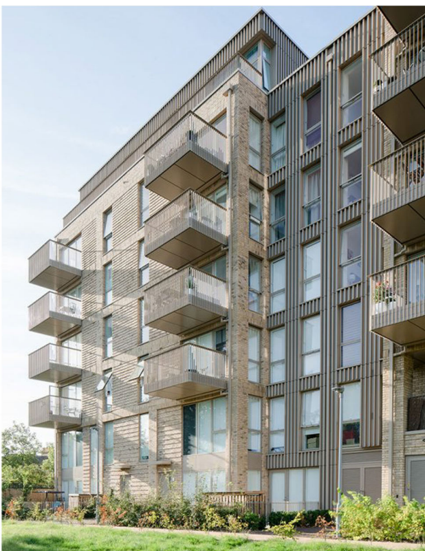
Catford Green // Glen Howell Architects [London, UK] The materiality of the top floor outlines a distinctive top expressed through articulated metal panels which provide rhythm and depth to the facade.